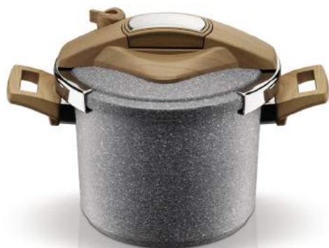
Pressure Cooker Novelta