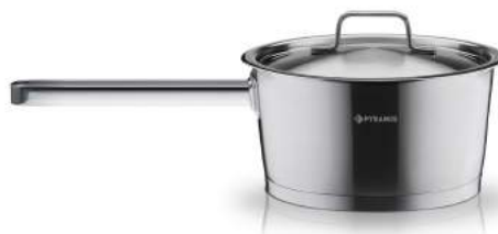
Saucepan Steel Line