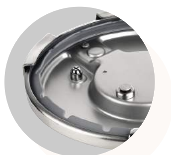
4 level safety system