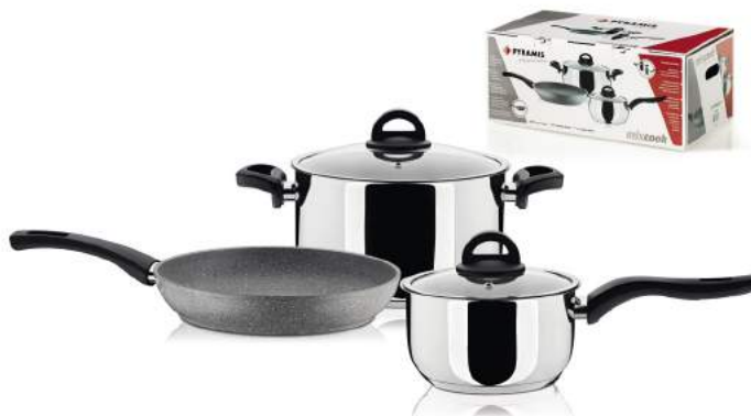
Mixcook Set (3+2 pieces)