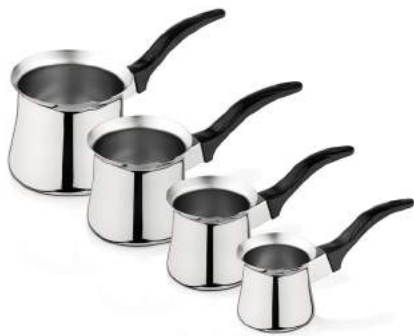
Standard Coffee Pots