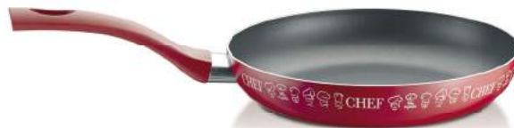
Frying Pan Olympia Trendy