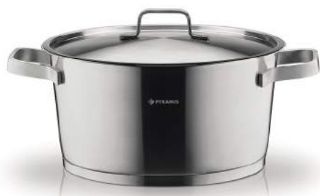
Kettle Steel Line