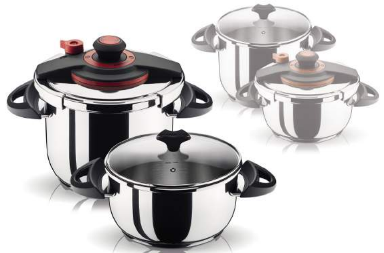
Pressure Cooker Set Optimum Plus 2+2