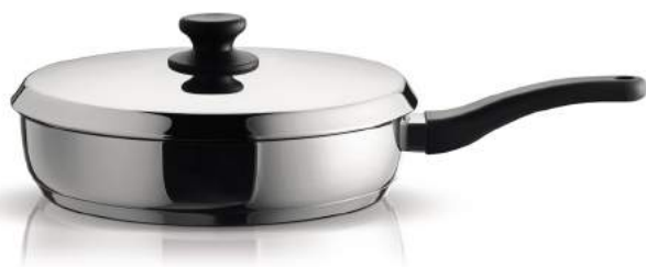
Frying Pan with Lid Zeon