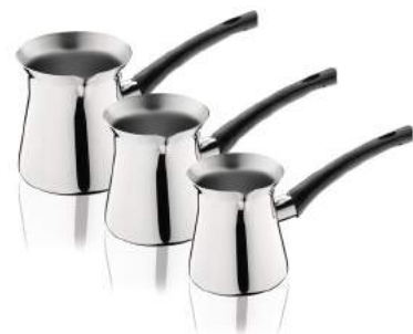
Advanced Coffee Pots