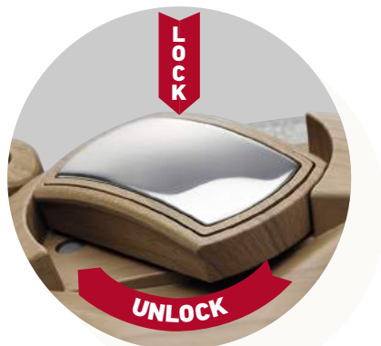
Advanced lid that locks at any place on the pressure cooker pot