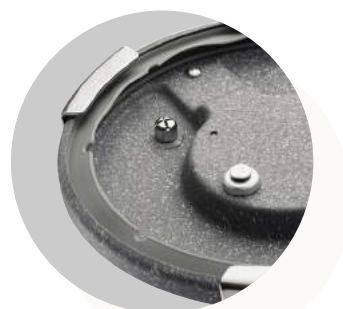
4 level safety system