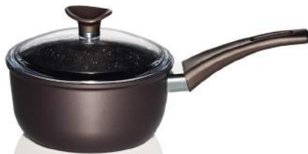
Saucepan Stone Chef