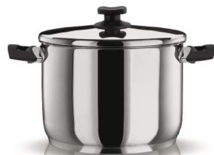
Deep Pot Classic