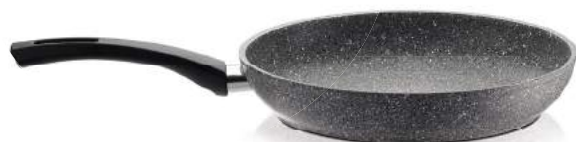
Frying Pan Grey Force