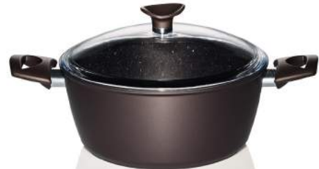
Kettle Stone Chef