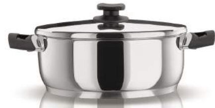
Half Kettle Classic