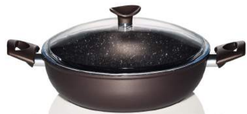
Saute Pan Stone Chef