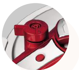
3 level pressure adjustment valve