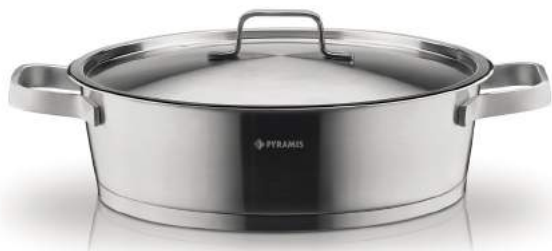
Saute Pan Steel Line