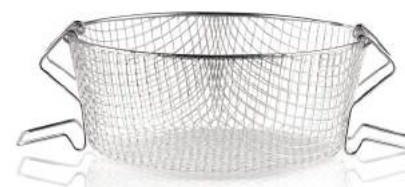
Basket (for Kettle Ø24)