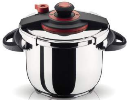
Pressure Cooker Optimum Plus