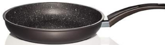
Frying Pan Stone Chef