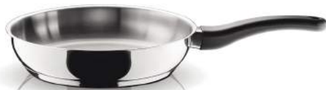
Frying Pan Classic