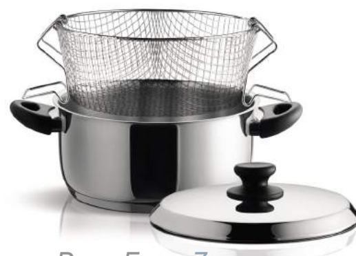
Deep Fryer Zeon