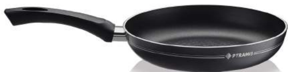
Frying Pan Olympia