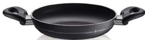
Two Handle Frying Pan Olympia