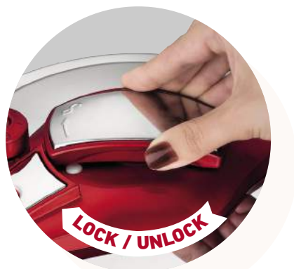
Advanced lid that locks at any place on the pressure cooker pot