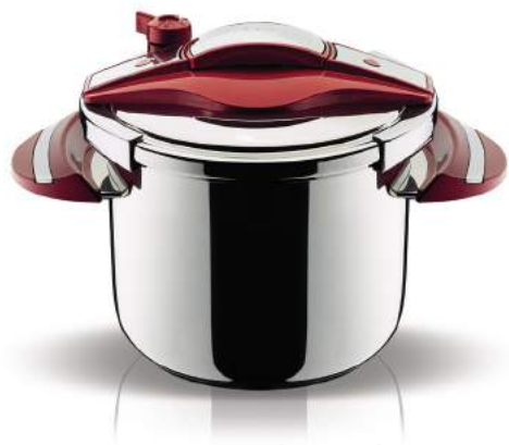
Pressure Cooker Chroma