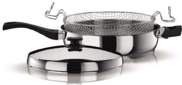
Frying Pan with Lid Classic